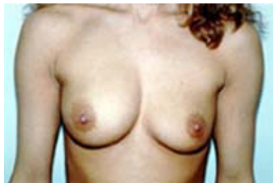
Photograph 2: Deflation in augmentation patient.

Photograph 2 below shows a 30-year-old woman's left saline-filled breast implant deflation. 19 The suspected cause was the leaf-valve design of the implant, which is no longer being used by manufacturers.