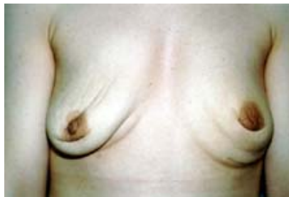
Photograph 1: Implant removal without replacement in augmentation patient.

Photograph 1 below shows the same 29-year-old woman in Photograph 3 (see the Capsular Contracture subsection below) one year after removal of her silicone gel-filled breast implants without replacement. 13 Women with large implants, particularly those inserted subglandularly (under and within the breast glands but on top of the chest muscles), may have a major cosmetic deformity if they choose not to replace them or to undergo additional reconstructive surgery.