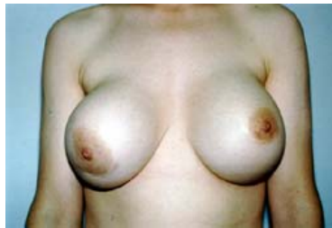
Photograph 3: Capsular contracture in augmentation patient.

Photograph 3 below shows grade IV capsular contracture in the right breast of a 29-year-old woman seven years after subglandular placement of 560cc silicone gel-filled breast implants. 29